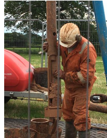
Example of Ground Investigation works