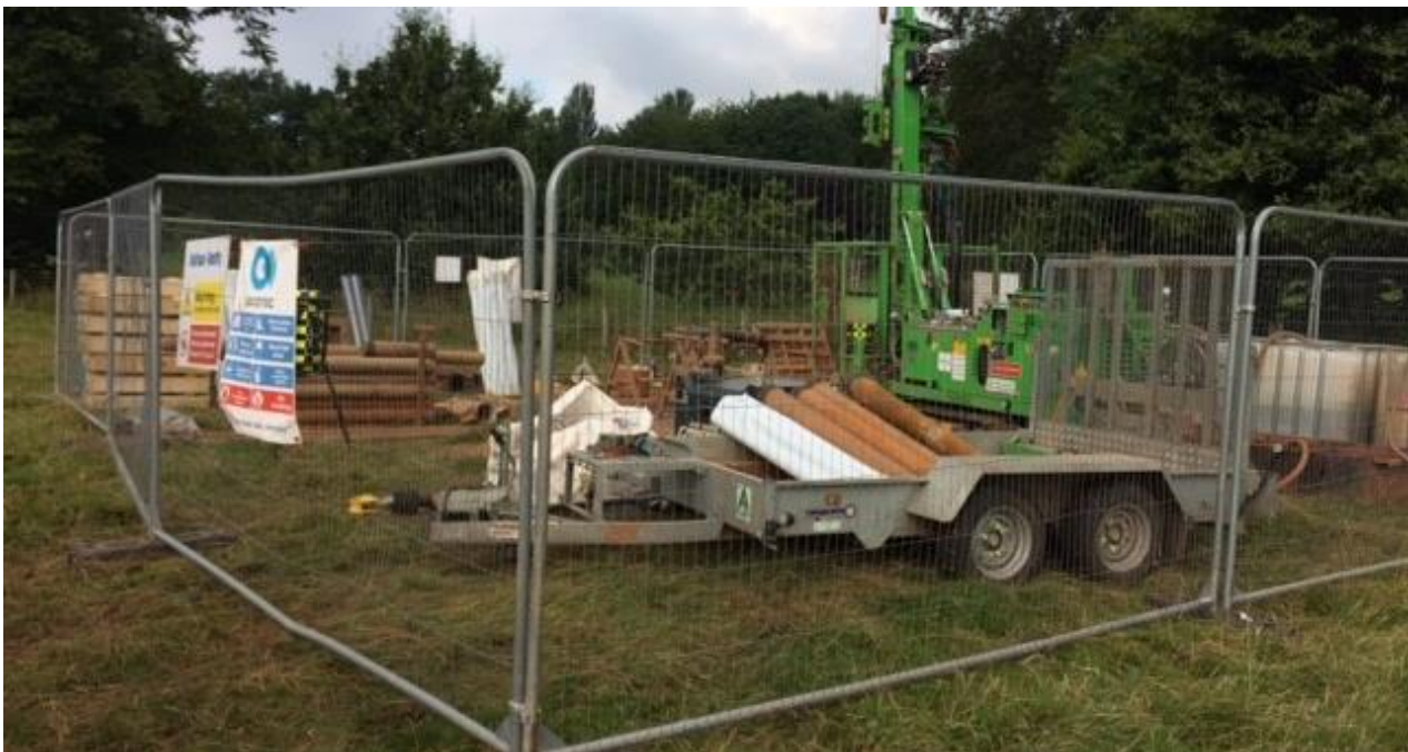
Example of trial boring that make up part of the ground investigation work